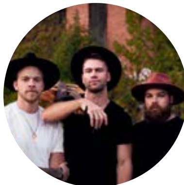
Ashes & Arrows