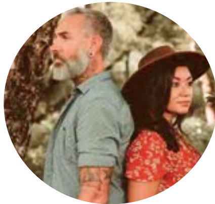
gypsy & me