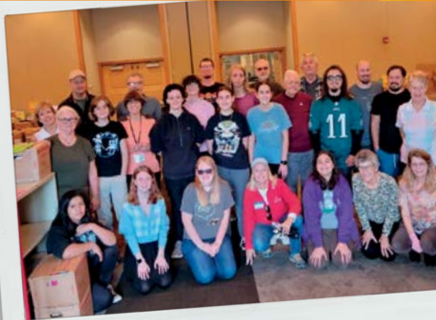
Brevard High School Tri-M Honor Society with the Annual Book Sale Moving Crew

Register your team of 2-4 players beginning November 28. Race to finish jigsaw puzzles and outpace your challengers! Points are awarded for speed, and the team with the highest score will be crowned Puzzle Champions.